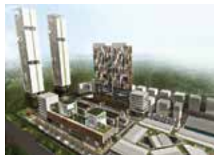
Sekitar 26 Shah Alam Appointed Sales Agent Paramount Corp Bhd