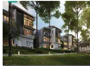
Sejati Resi Cyberjaya Appointed Sales Agent Paramount Corp Bhd