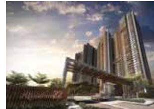
Residensi 22 Mont Kiara Appointed Sales Agent UEM Sunrise