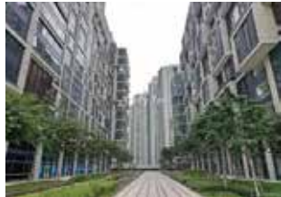
Arcoris Mont Kiara Appointed Sales Agent UEM Sunrise

Since year 2000, Esprit has successfully marketed 58 developers' projects and the following are some of the projects that we marketed since 2012