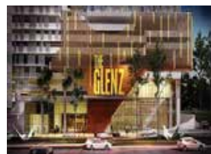
The Glenz Glenmarie Appointed Sales Agent Sg. Besi Construction Sdn Bhd