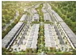
Maples Cyberjaya Appointed Sales Agent Gadang