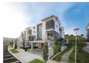
Sejati Resi Cyberjaya Appointed Sales Agent Paramount Corp Berhad