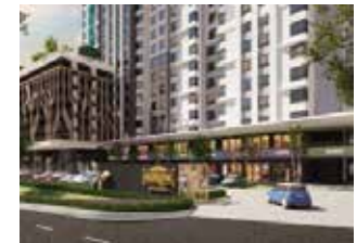
Damai Seiring Appointed Sales Agent Titijaya Bhd