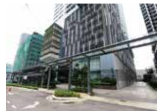
Summer Suites KL Appointed Sales Agent UEM Sunrise