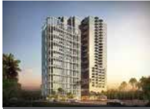
Rei Seraya Ampang Appointed Marketing Consultant on retainer basis UEM, PHB, MCS, Mitsui