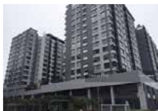
Utropolis Glenmarie Appointed Sales Agent Paramount Corp Bhd