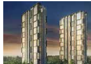
Symphony Hills Cyberjaya Appointed Sales Agent UEM Sunrise