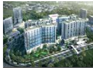
Mizu Ara Damansara Appointed Sales Agent Titijaya Bhd