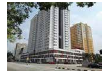
Palm Garden Appointed Sales Agent Acmar Bhd