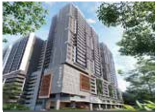
Habitus Appointed Sales Agent Newfields