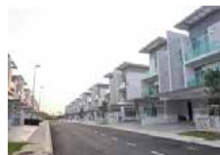
Clovers Garden Resi Appointed Sales Agent Mahsing