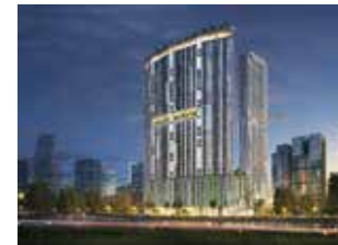
Riveria Sentral Appointed Sales Agent Titijaya Bhd