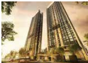
Solaris Parq Mont Kiara Appointed Sales Agent UEM Sunrise