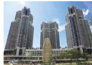
Teega Office Nusajaya Appointed Sales Agent UEM Sunrise