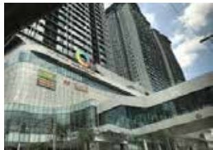
KL Gateway Bangsar South Appointed Sales Agent Suez Cap Sdn Bhd