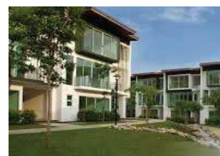
Symphony Hills Landed Appointed Sales Agent UEM Sunrise