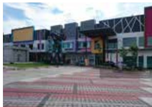
Sentral Bazar Nilai Appointed Sales Agent SL Land Sdn Bhd