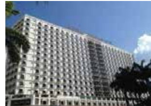
Heritage Condo Malacca Appointed Sales Agent Digistar Bhd