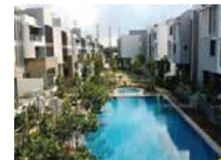
Ophiria Nusajaya Appointed Sales Agent UEM Sunrise