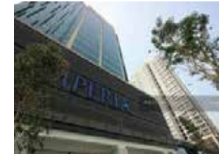
Imperia Nusajaya Appointed Sales Agent UEM Sunrise