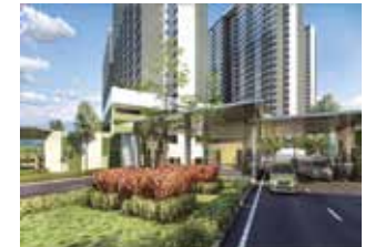
Lake Front Homes Appointed Sales Agent MCT