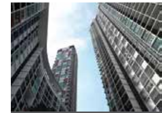
I-Suites I-City Shah Alam Appointed Sales Agent I-Berhad