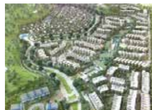
Symphony Hills Cyberjaya Appointed Sales Agent UEM Sunrise