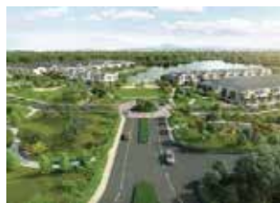
Sejati Lakeside Appointed Sales Agent Paramount