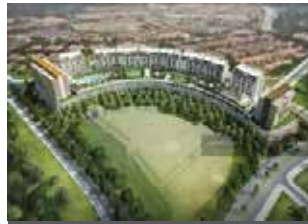
Radia Bukit Jelutong Appointed Sales Agent Sime Darby UEM Sunrise